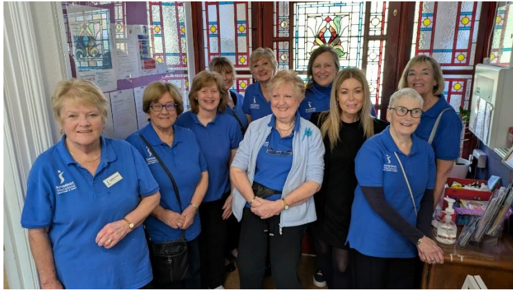
Some of our members at the event